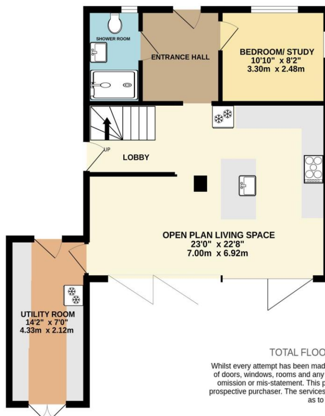
GROUND FLOOR 1108 sq.ft. (102.9 sq.m.) approx.